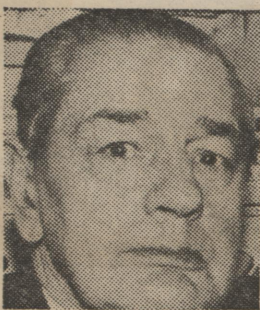
Lord Clancarty: "It's a Whitehall cover-up"

Lord Clancarty, leader of the peers, is determined to call a full House of Lords debate on UFOs after getting defence officials to admit they examined reports of 2,250