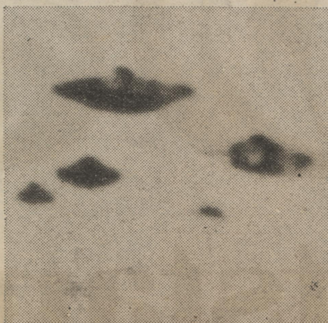
SPOTTED . . . Sheffield 1963