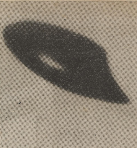
SPOTTED . . . Phoenix 1947